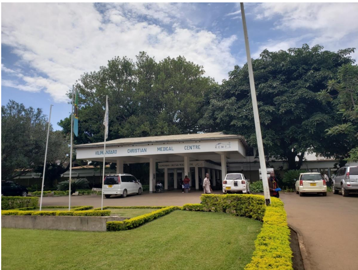
Figure 1. Main entrance of Kilimanjaro Christian Medical Centre (KCMC) in the city of Moshi, Tanzania

In November 2023, I was part of a team of Urologists who took part in a reconstructive workshop at the Kilimanjaro Christian Medical Centre (KCMC) in the city of Moshi, Tanzania (Figure 1). I was a Urolink Fellow, and it was made possible with the generous support from The Urological Foundation.